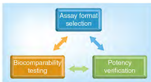
Figure 1. Approaches to method development.

Parallel line analysis may be performed by comparing dose response curves from the biosimilar and the innovator drug products [15]. If the curves for biosimilar and innovator are found to be nonparallel, it will indicate that there is a potency difference between the biosimilar and innovator. In the context of biosimilar PK assay development, potency is defined as the ability of a drug/analyte to bind with assay reagents (i.e., capture protein and detection protein). It is a measure of a drug's immunoreactivity to the assay reagents. A WHO or other international public reference standard, when available, may be used as an anchor reference